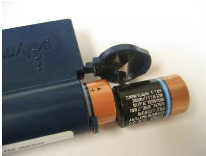
Figure 3: Slide open the lid to change the batteries