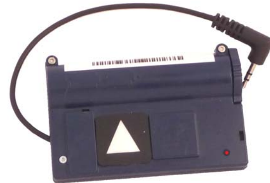
Figure 1: Red light on lower right indicates status of the GMA. Square button with white triangle is “Start” button.

The GMA has a small red indicator light that blinks in different patterns when it is doing different things. It also has a START (▶) button.