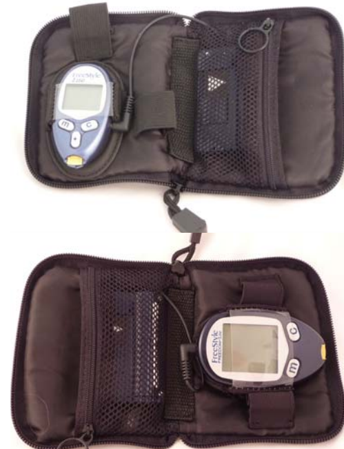
Figure 5: glucose meter and GMA in carrying case. Above: FreeStyle Lite and FreeStyle Freedom Lite. Note different position of GMA to make closing cover easier with larger meter