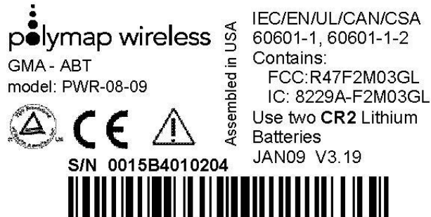
Figure 8: Label on the bottom of the GMA

The label on the side of your GMA shows the unique ID number (serial number) of your device as well as some other things you might need to know: