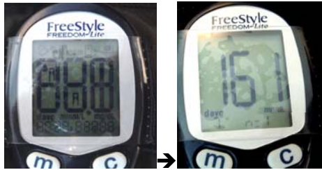
Figure 6 All display segments light up, then a single reading shows on the meter when the GMA is receiving your readings.