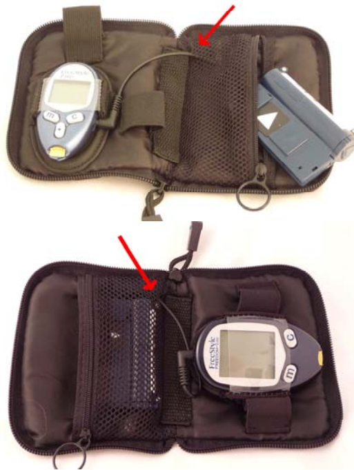
Figure 4: modification to the carrying case. Please note different position of slit for FreeStyle Freedom case.