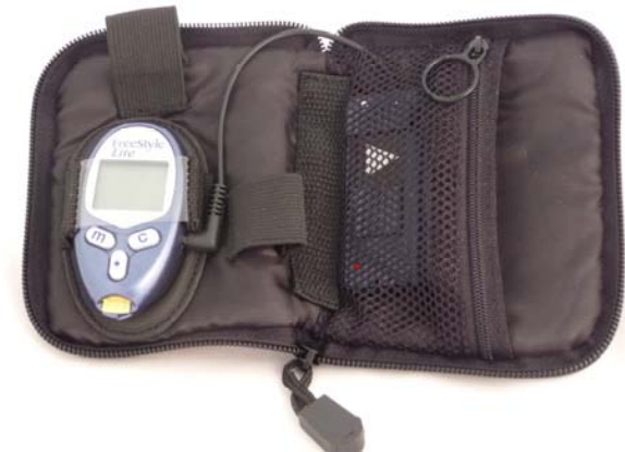
Figure 7: Blinking light usually means your information is being sent. Please be patient.

After taking your glucose reading, it may take a minute or two to send the reading to the receiving station. Please be patient —do not press any buttons or disconnect the GMA until the light has completely stopped blinking or your results may not be sent.